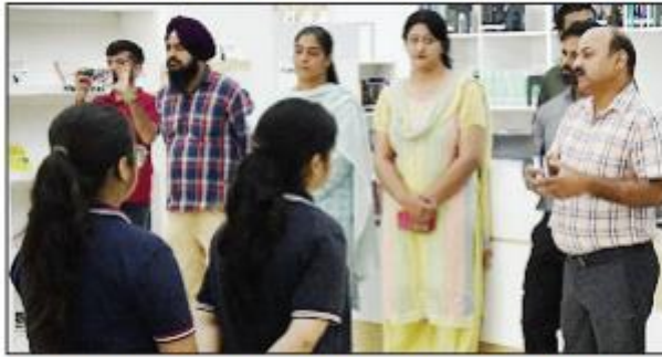
Student and Staff of IDRS being briefed at Library, IIM Jammu